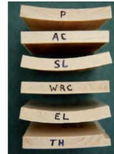
Accoya was the only wood that did not cup in this BM Trada trial. From top to bottom: Pine, Accoya Wood, Siberian Larch, Western Red Cedar, European Larch and Thermowood.